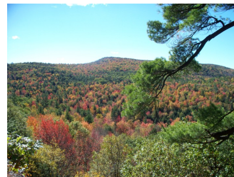
View from the outlook

Find the trail to Tippin Rock from a hayfield on Warmac Road across from Chebaco Kennel.