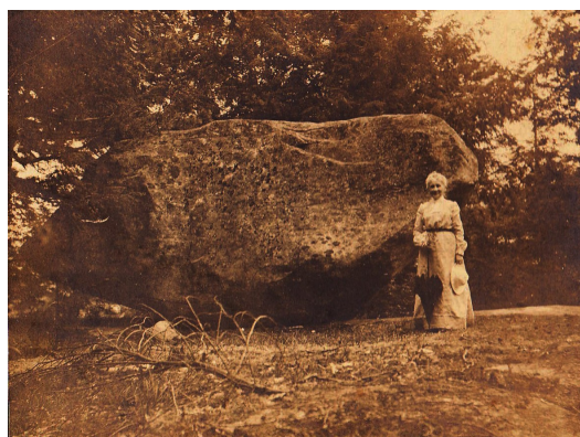
Tippin Rock in years past