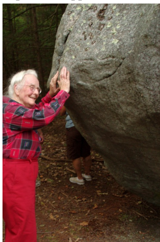
Tippin Rock today

Visitors are reminded to remain on marked trails and to stay away from active agricultural fields and wood harvesting operations.