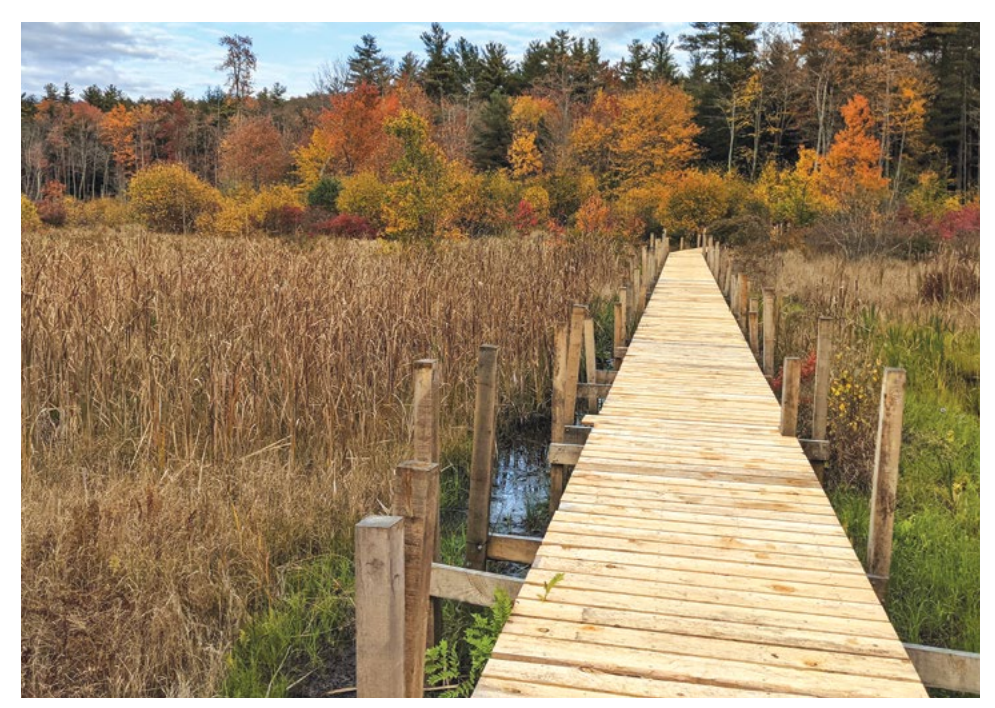
Oak timbers anchor this new boardwalk for a longer lifespan.

The new boardwalk on the Cranberry Meadow Pond Trail off Old Street Road in Peterborough is officially open! We apologize that lumber shortages and delays pushed this project much, much later into prime hiking season than we anticipated. This boardwalk is built for decades of use. Being elevated, it's better for the wetlands. And, between seasonal high water and climate change increasing the intensity of rain storms, it's better for our feet, too.