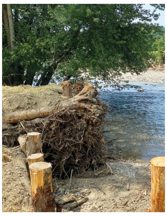
Rootwads are placed along the edges to direct the streamflow away, thus reducing erosion and naturally restoring the riverbanks.

These masses will slow the river during floods, preventing erosion and allowing the riverbank to revegetate naturally. In time, the timber will decompose, but the new vegetation should hold the riverbank in place, protecting the soil and re-creating important riparian habitat. Bank edges support an entire web of organisms, from insects to amphibians, reptiles, and fish, and on up the food chain.