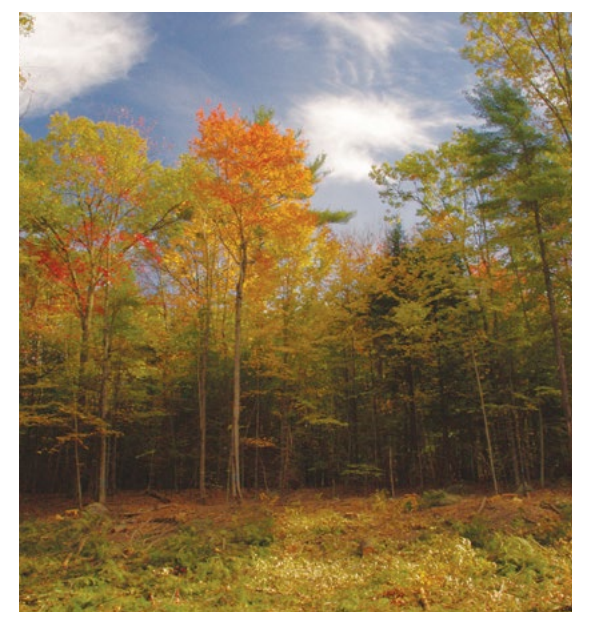
Forest openings like this typically encourage the growth of red oak — but deer will eat the seedlings.

each month. She took note of what tree species were growing as well as their size and condition. Fenced plots were flush with young trees. In the unfenced plots, by contrast, nearly all tree seedlings, especially oaks, had been eaten. The evidence is clear that the large deer population to the south, on City of Keene land where hunting is prohibited, is exerting heavy pressure on the Maynard Forest. "These forest openings should be great for red oaks, but the deer aren't giving them a chance," Hannah said. "It's both challenging and fascinating to balance wildlife's natural order with other goals for the forest."