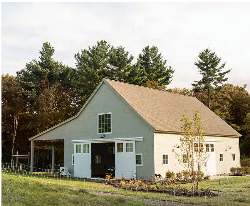
Alison Marie Photography

The Monadnock Conservancy is turning 30 — what a great excuse for a party! Come for a fun, family-friendly evening of dancing and good eating at Mayfair Farm in Harrisville, N.H., on Saturday, November 2, from 5 to 8 p.m. Highlights include tours of the farm, where you'll find pigs, sheep, chickens, and stunning views from the green pastures; a live band; farm-to-table fare; and a cash bar. The evening wouldn't be complete without outdoor games and a campfire (bring your S'mores stick). Reserve tickets in advance before they sell out: $30 per adult, $10 for ages 7–12, children 6 and under are free. Please get your tickets online (see our Facebook page) or at the Monadnock Conservancy office. For more information, please email Lindsay Taflas at Lindsay@MonadnockConservancy.org or call her at 603-357-0600, ext. 113.