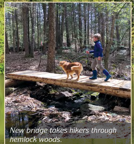
New bridge takes hikers through hemlock woods.