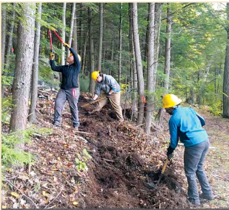
Volunteer youth crew blazes a new trail.