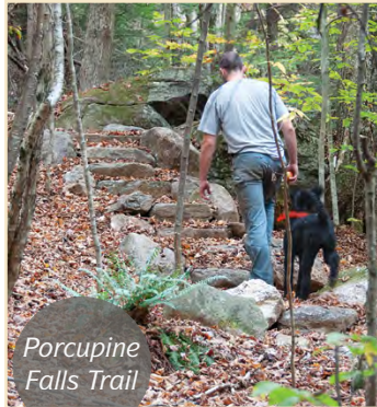
Porcupine Falls Trail

This meandering out-and-back trail (about 0.7 mile round trip) travels through a mixed hardwood-conifer forest rich with mosses and ferns. It follows the quintessential babbling White Brook and culminates at a bridge below “Porky Falls,” as the Calhoun family called it. There are a few stone steps to climb along the way, but elevation gain is minimal. To make the hike a loop, cross the bridge at the falls and follow the trail a short distance to White Brook Road, which returns to the parking lot at the beginning.