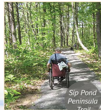
Sip Pond Peninsula Trail

Panoramic views of Mount Monadnock and water access in all seasons from a rocky point await. The 1.6-mile round-trip walk follows the Cheshire Rail Trail for most of the route and is generally flat. From the trailhead parking area, a short spur trail leads to the rail trail, which follows the southern boundary of the conservation property, skirting a broad wetland on the edge of Sip Pond. Access to the peninsula trail is at an orange gate on the right. While nearly the entire route is on gravel, the last bit is narrower and requires stepping over rocks and around bushes.