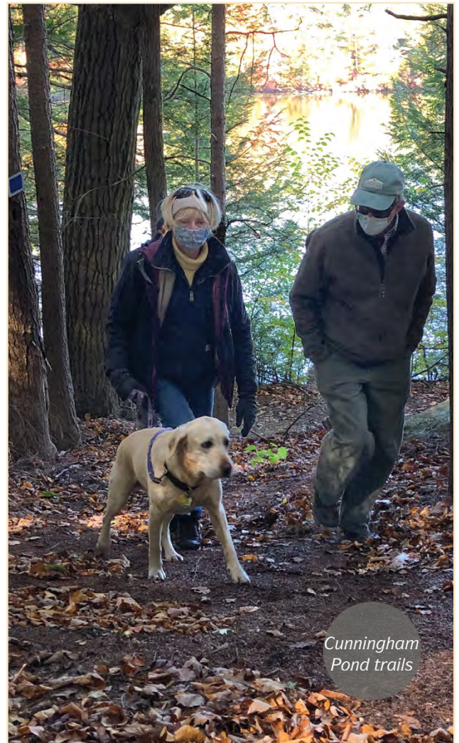
Cunningham Pond trails