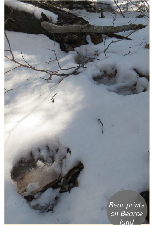
Bear prints on Bearce land

The Bearces’ decision to protect the land and care for it in perpetuity shows an intrinsic understanding that using the land also means giving back — to the plants and animals, and to the public who benefit as well.